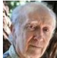
John B. Cobb, Jr.

Founder at the intersection of philosophy, religion, and the environment.